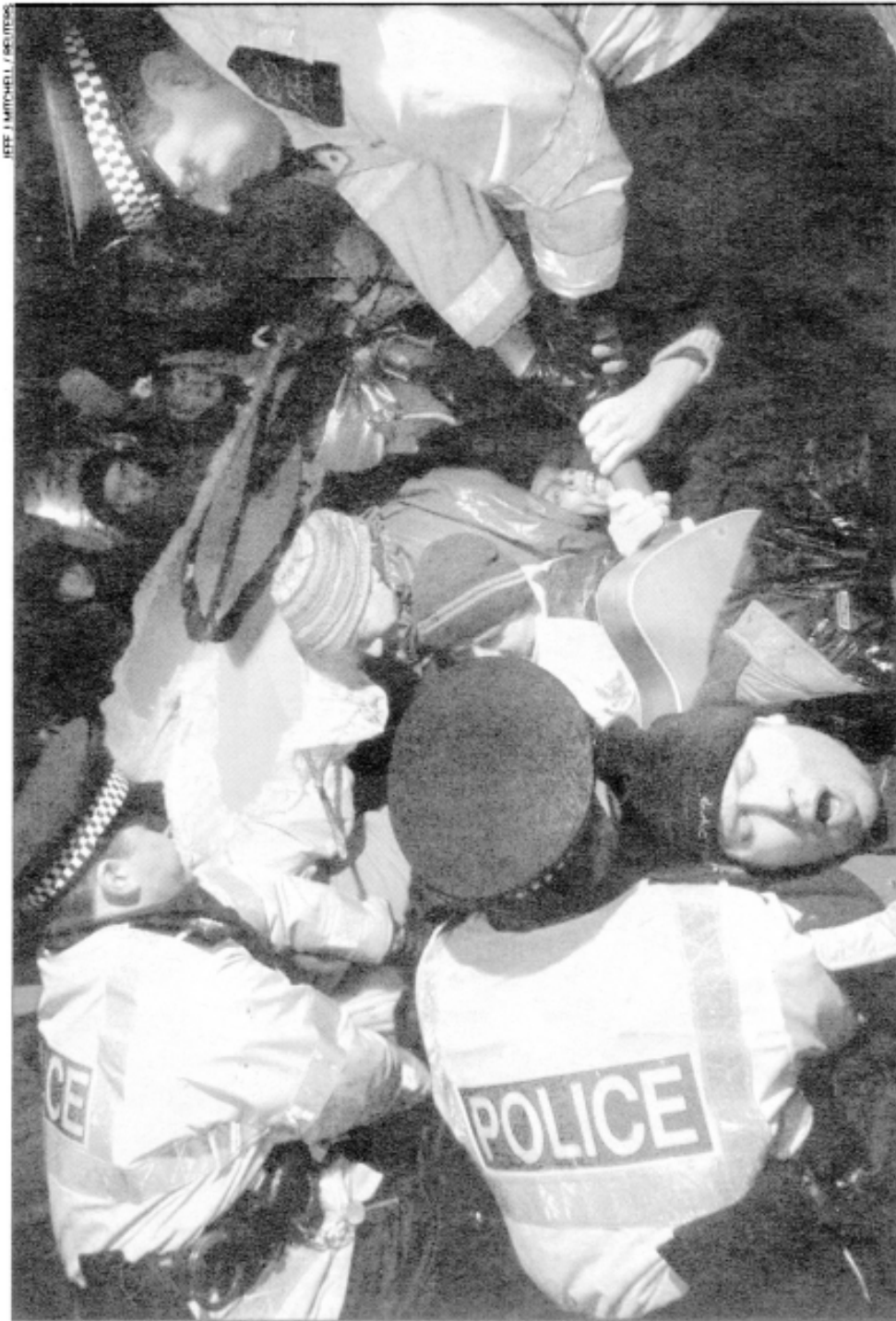
Police attempt to remove protesters from the entrance to the Faslane Naval Base yesterday. About 400 protesters tried to block the main entrances