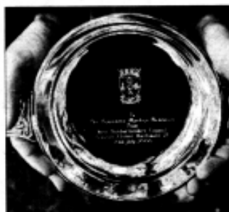
Ploughshares activists sit it out at Coulport, top, and the quach presented to them by West Dunbartonshire's Lord Provost

"We are here to overcome the latest manifestation of the dark arts," he told his fellow campaigners. Condemning MoD workers as "muggles" and Trident submarines as "unclear weapons", he added: "They can't distinguish between soldiers and civilians, friends and the enemy. They can't tell the difference