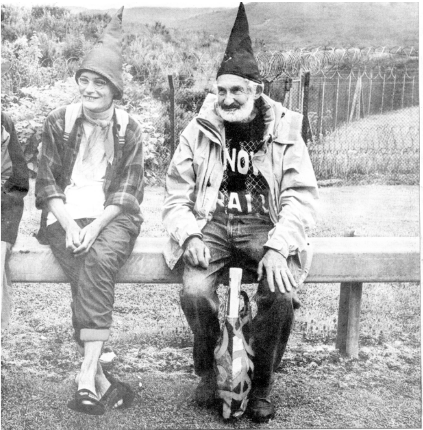
SCOTTISH SUNDAY HERALD 13/8/2001

he says. "Most of us treat this as our summer holidays."