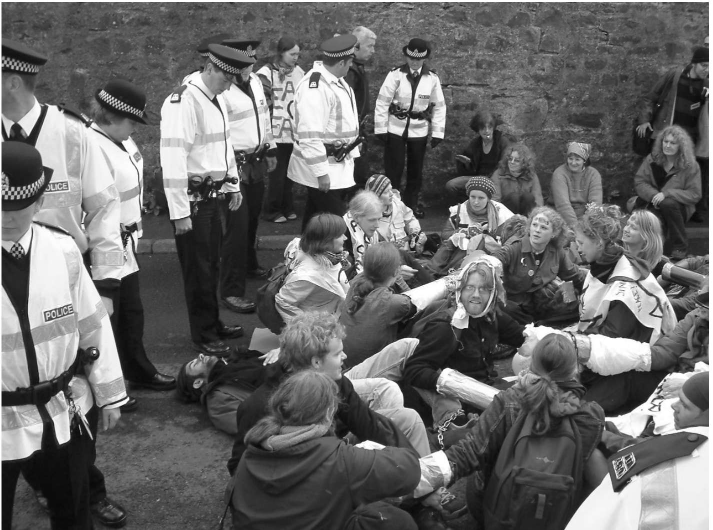
Blockaders at the south gate

This was the seventh in the recent series of mass blockades of Faslane, which began with the Love the Planet blockade in February 1999.